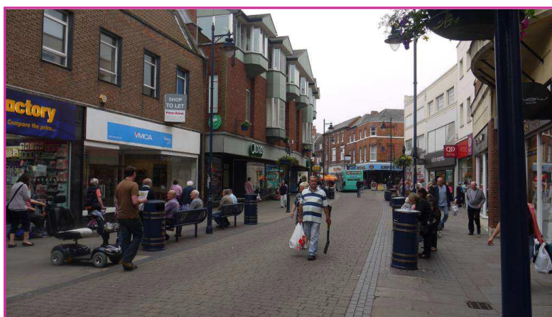
Strait Bargate, Boston

The table above shows that the percentage of A1 units in both Boston and Spalding’s primary shopping frontages has remained fairly stable between 2009 and 2016. The greatest change occurred between 2012 and 2013 in Boston where there was almost a 20% decrease in the number of A1 units in its primary shopping frontage. Nonetheless, Boston has consistently had a greater percentage of A1 units than Spalding in the town’s primary shopping frontage. In comparison to Boston’s primary shopping frontage, the percentage of A1 units in its primary shopping area has generally been lower.